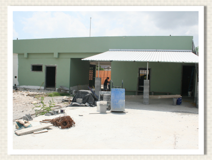
FUTURE CLOTHING AND FOOD PANTRY