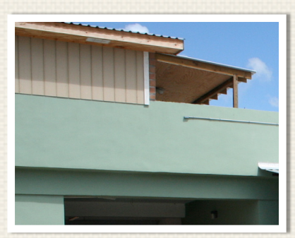
MICAH AND JENNY'S COMPLETED HOUSE