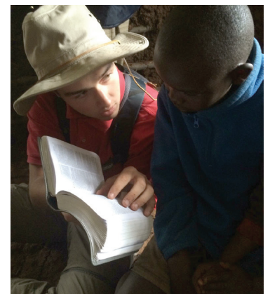
Keyna - an opportunity for 6 to learn and live the gospel.