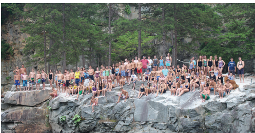
100+ enjoy a day of fun at Carrigan Farms.