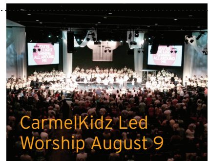
CarmelKidz Led Worship August 9