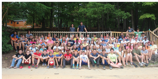
100+ escaping to the mountains for ECamp.